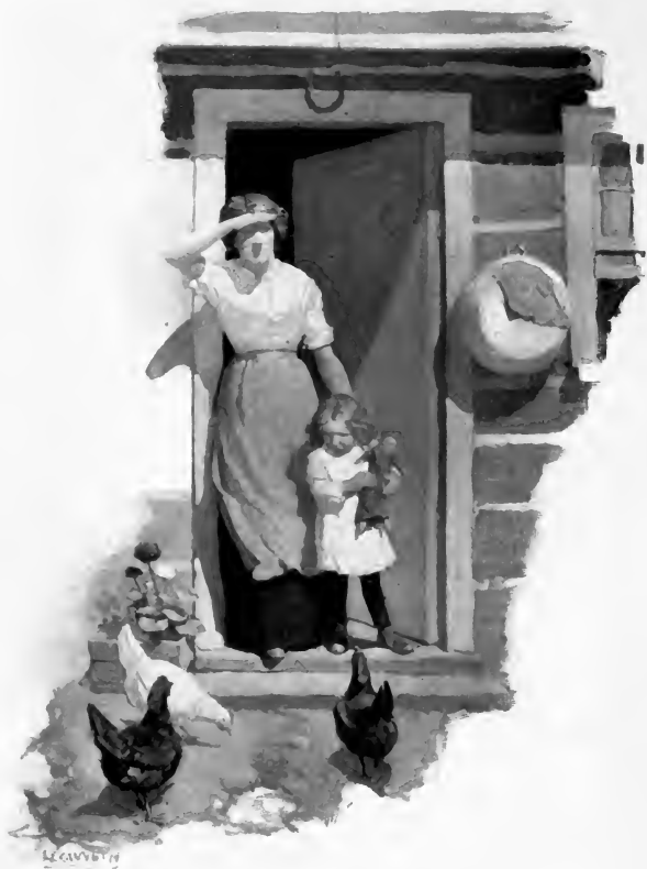
THE WOMAN HOMESTEADER